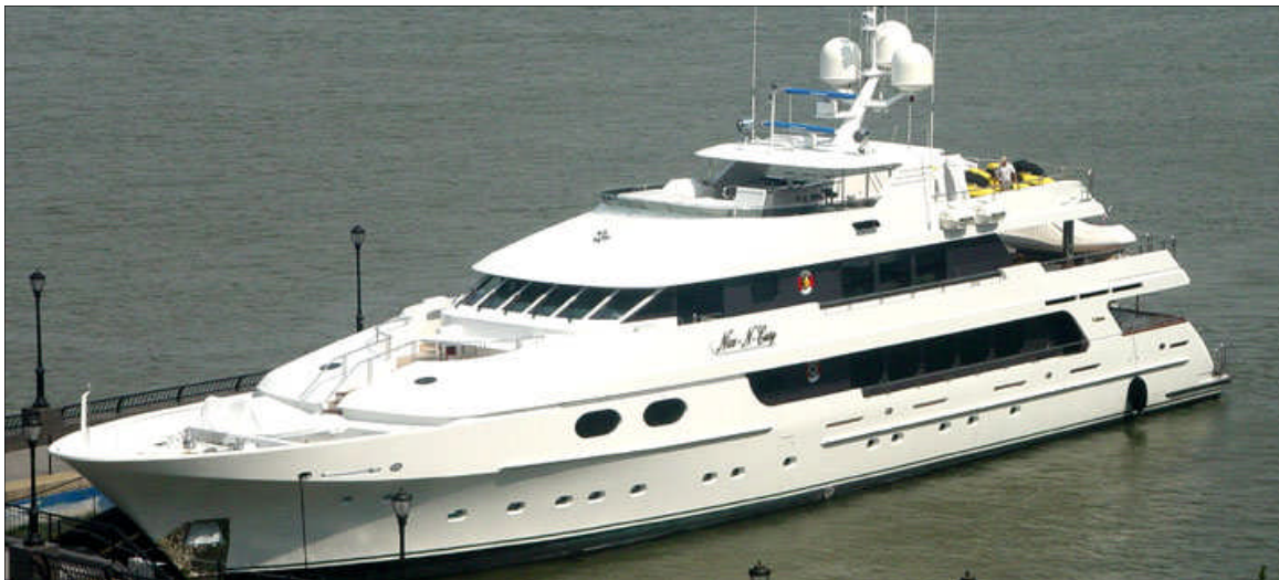
Nice N' Easy is one of the brightest stars at North Cove and she uses the marina as her home base in the North East.

If time allows, the Dock Master will photograph your yacht when you arrive at the marina. After docking, he will ask you for basic specifications about your boat as well as public interest items such as where you have been and what great experiences you have had. This information is then provided to the public. If you overhear someone walking by your yacht explaining details to their guests, you will know why.