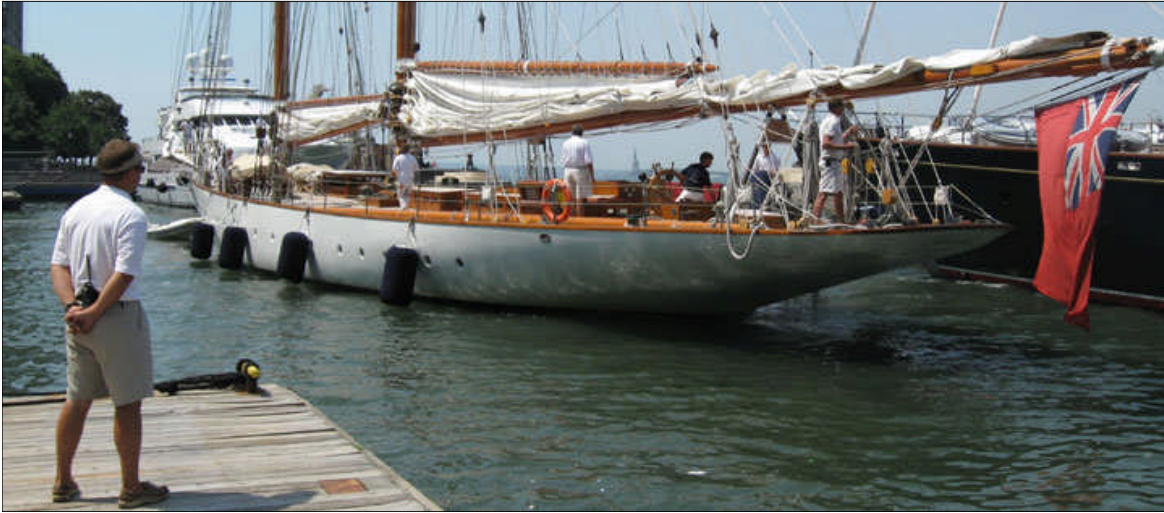
Eleanora pulls into her slips for the July 4th weekend as the North Cove dock master stands by to catch her lines.