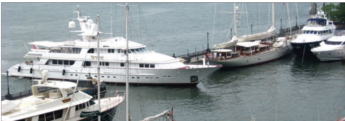
Braveheart enters North Cove during slack water which is usually 2 1/2 hours after high and 3 1/2 hours after low water.

When arriving from a foreign port, yachts are required to clear immigration and customs. There is a Customs Office which is located at Pier 92 on the Hudson River and part of the Passenger Ship Terminal (711 12th Avenue at 54th St). Another way to clear customs and immigration is to take a taxi to JFK airport. Please check with the Marina Manger for assistance.