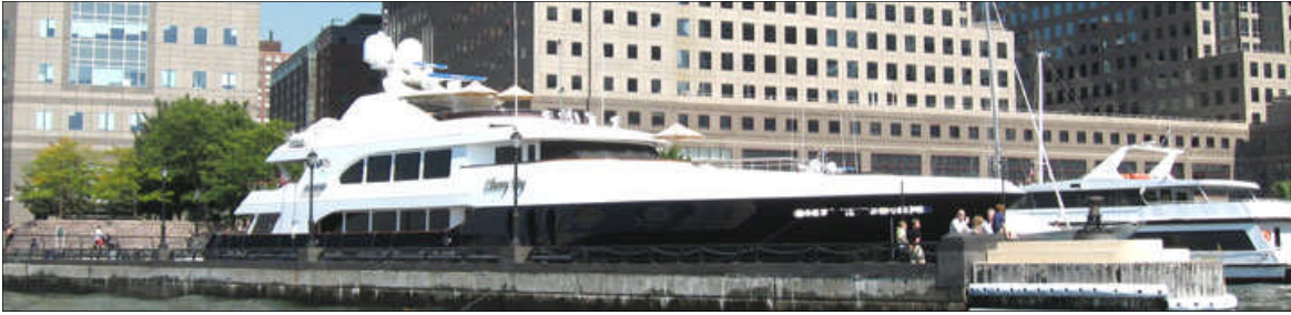
Chevy Toy sets a commanding and inspiring presence along the North break wall.