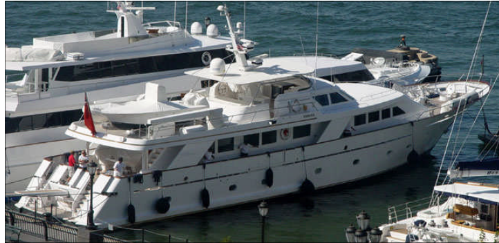
North Cove offers breakwall, floating dock and med moor slips. There is an underground chain mere system so that marina will hand you a bowline.

North Cove has an underwater chain mere system with 1 1/2" hawsers for mega yacht slips. When you dock at North Cove, mega yachts are requested to attach their stern lines to the quay bollards and then take a bowline from our staff to tension their yacht in position. All mega yachts should tie into the chain mere even if you are on a floating dock.