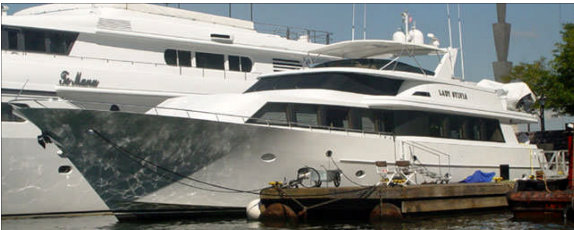
Lady Silvia has been one of the seasonal yachts docked at North Cove for the past few years.

The current stops flowing just inside the seawall so it is relatively easy to exit the marina at all current stages. Once outside the entrance, care should be observed as you will immediately begin moving in the current direction.