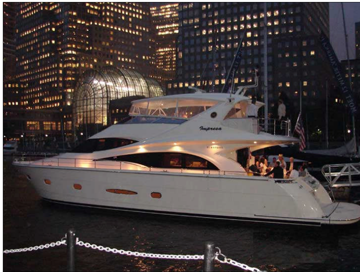
North Cove offers an unmatched location for entertaining friends and business customers and clients. Everyone in the city loves to come down to "Monaco on the Hudson."

Other Commercial Operations - Vessels wishing to engage in other commercial operations should contact the North Cove office to discuss needs and rates.