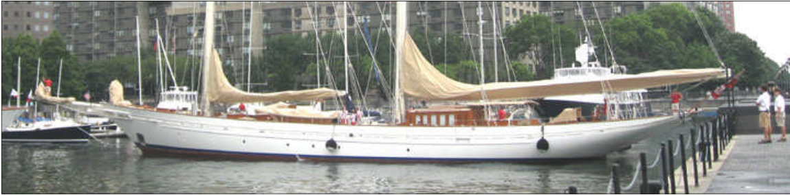
Adela arrives at North Cove in June 2008 and backs into slip N1.